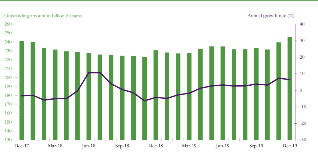
Chart 3: Change in Net international reserves